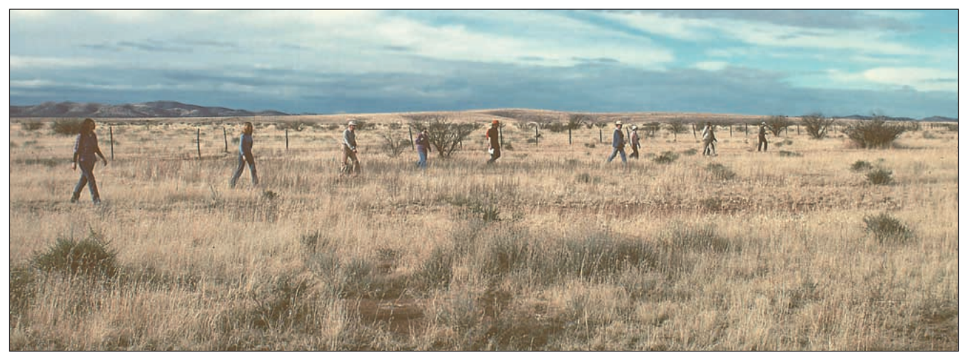
Figure 2. Counting birds in an Arizona grassland.

Avian population variables have been calculated in numerous ways (Ralph et al. 1993). Our approach was to divide each variable from the high-density area by its equivalent in the low-density area, to obtain unitless ratios that could be compared across all studies, regardless of their methods. First, we calculated a density ratio (Dhigh/Dlow). We next calculated ratios of per capita reproduction (Rc) and survival (S) in the higher density versus lower density study areas (Rc-Dhigh/Rc-Dlow; S-Dhigh/S-Dlow). These