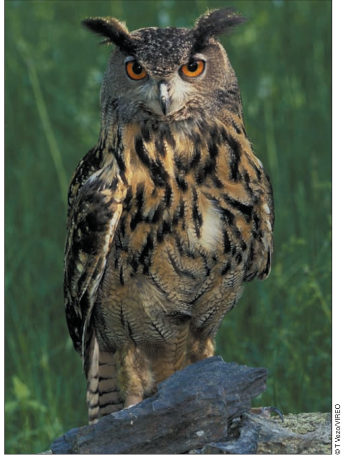
Figure 8. Eurasian eagle owl (Bubo bubo).

between density and habitat quality will probably come from studies of plants.