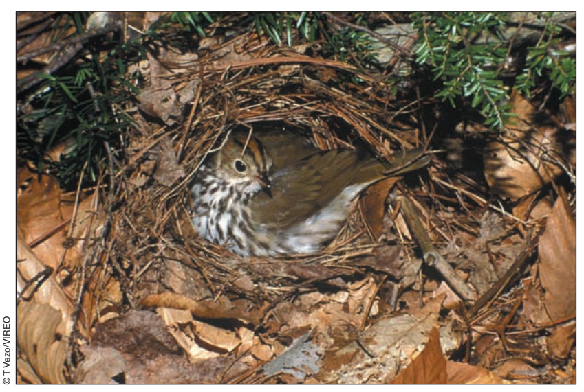
Figure 6. Ovenbird (Seirus aurocapillus).

The results of our survey suggest that European and North American birds are usually able to aggregate in the higher quality breeding locations, regardless of the