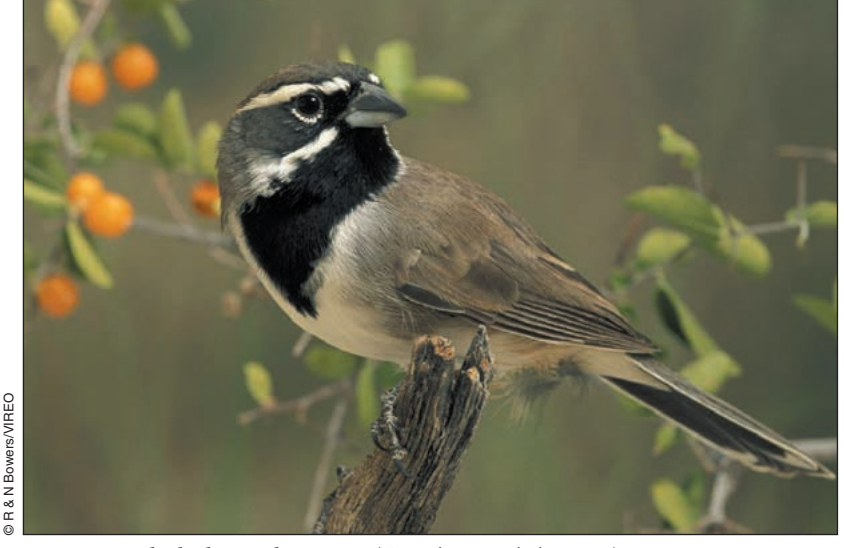
Figure 5. Black-throated sparrow (Amphispiza bilineata).

cient time, in terms of both avoiding ecological traps and seizing ecological opportunities. Among the 82 studies involving relatively disturbed sites, negative relationships between abundance and per capita reproduction were most common in western North America, intermediate in eastern North America, and least common in Europe (Table 1f), which ranks inversely with time since humans first imposed their agricultural, industrial, and urban impacts on the environment. At least in our dataset, the American West is the only place where negative relationships between density and reproduction have outnumbered the positive (Tables 1f).