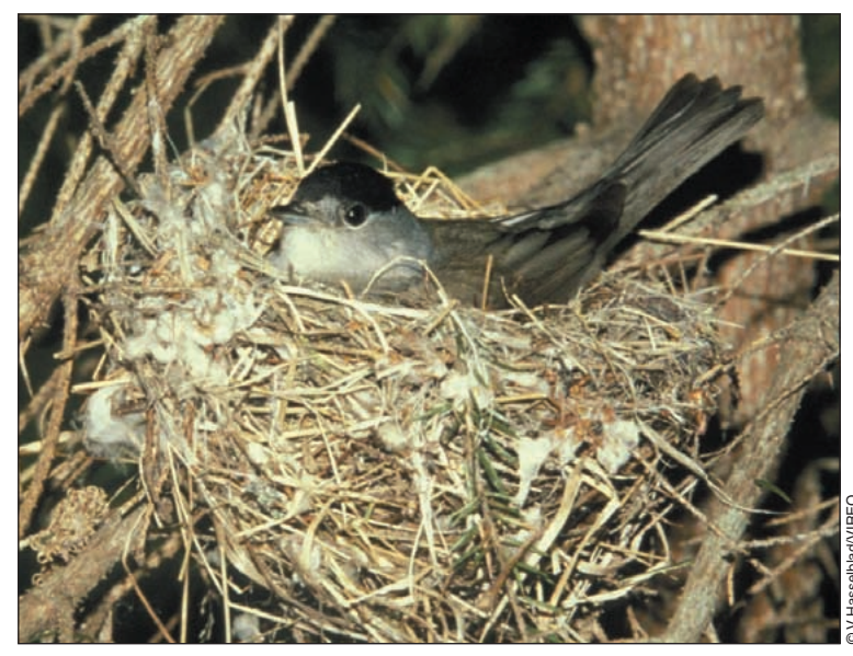
Figure 4. A nesting Blackcap (Sylvia atricapilla)

One intriguing pattern in the dataset suggests that birds might be able to adapt to human disturbance given suffi-